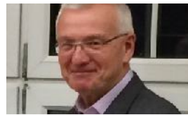
A MESSAGE FROM CHARLIE