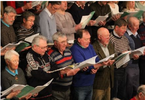
Soon to be rehearsing in the Villa?