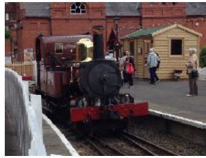
EVENTS TO COME